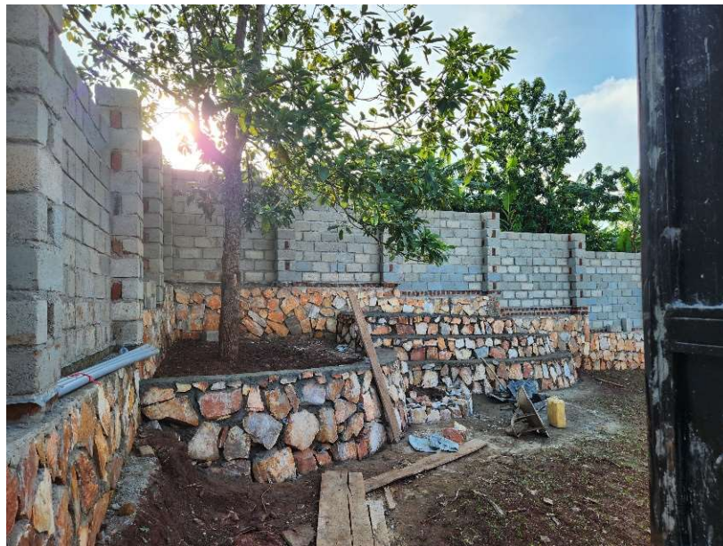
PLACE TO REFLECT AND SEATING FOR GROUP PRAYER