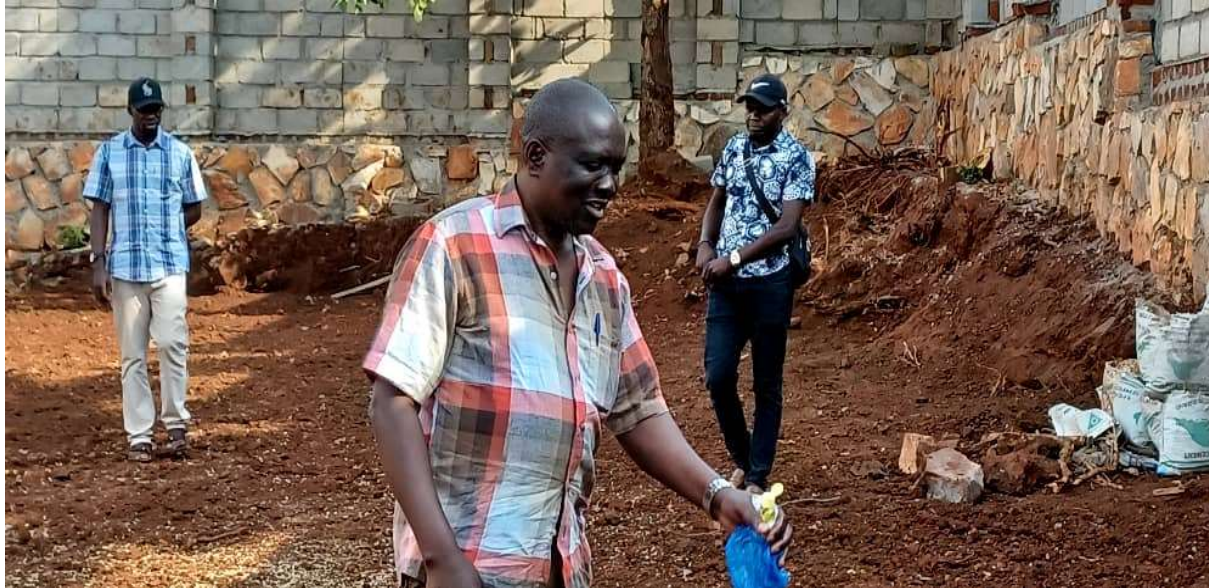
PASTORS PREPARING SPIRITUAL SOIL