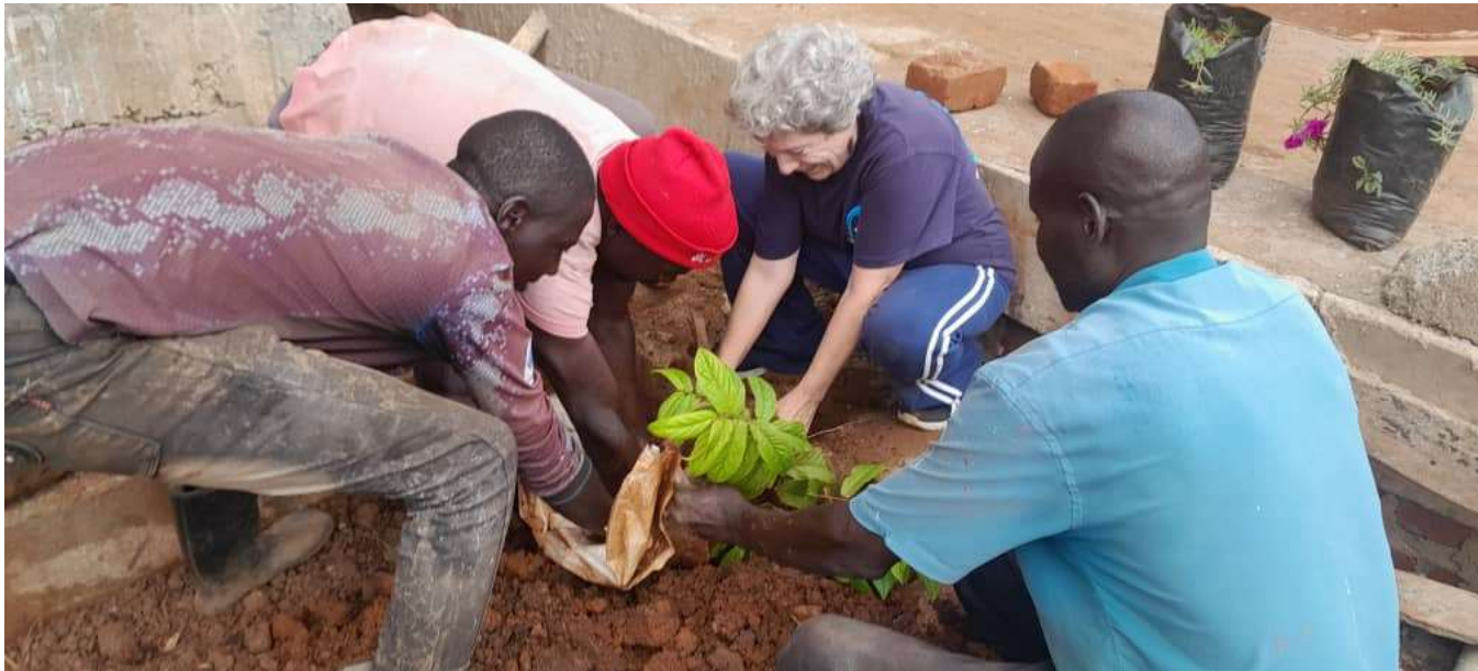
PLANTS WITH A PURPOSE