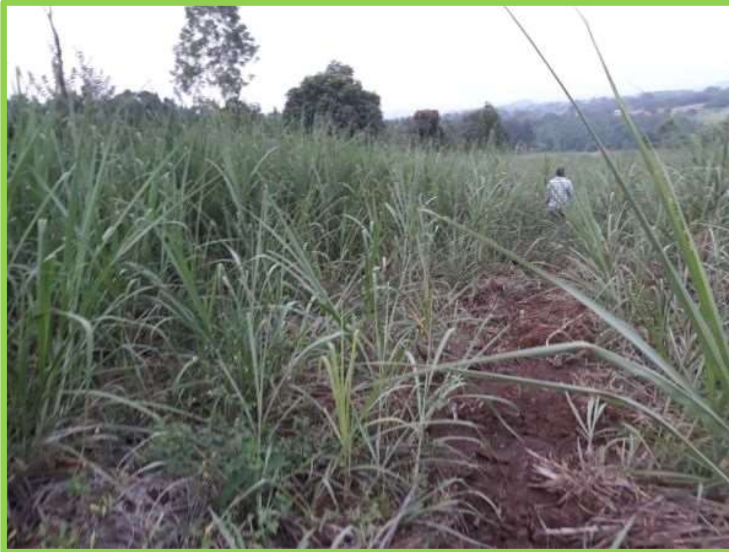
Sugar Cane Farm